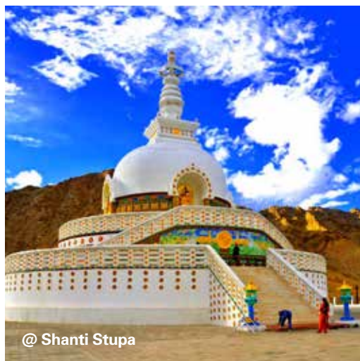
@ Shanti Stupa