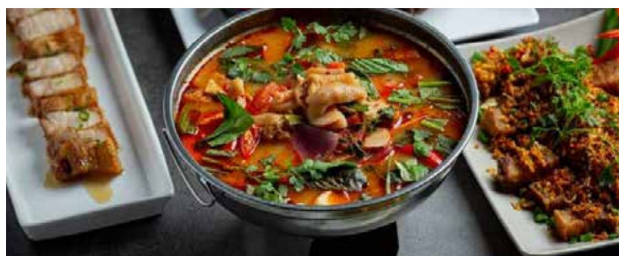
Traditional Ladakh Cuisine