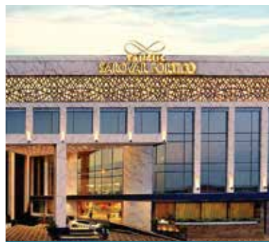
Taurus Sarovar Portico