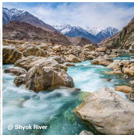
@ Shyok River