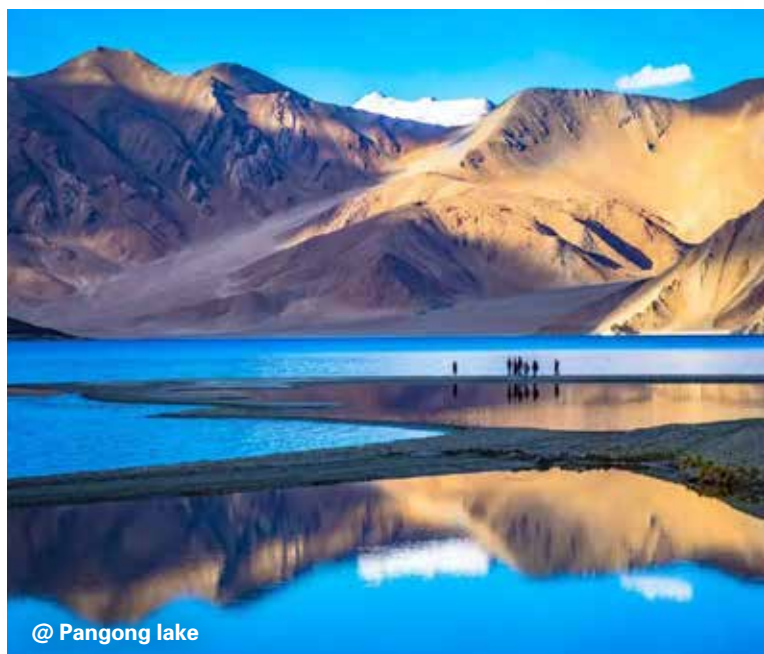
@ Pangong lake