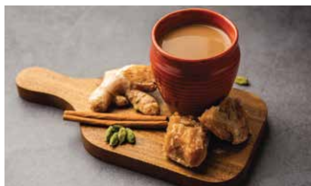
Gur Gur Chai