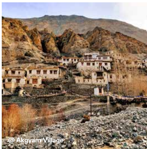
@ Akgyam Village