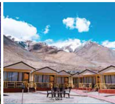
Pangong Woods Resort