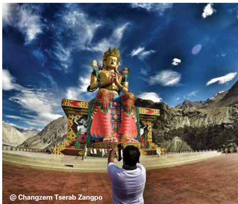
@ Changzem Tserab Zangpo