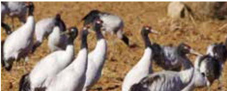
GANGTEY, Black-Necked Cranes