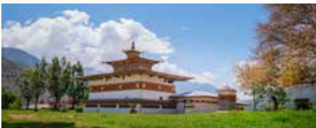
WANGDUE PHODRANG, Chimi Lhakhang