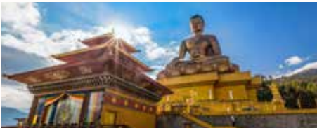
THIMPHU, Buddha Point