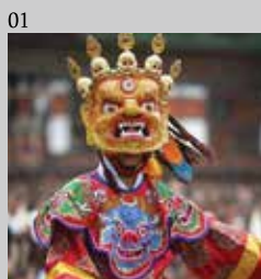
Bhutanese Cultural Dance 不丹文化舞蹈表演