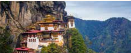
PARO, Tiger Nest