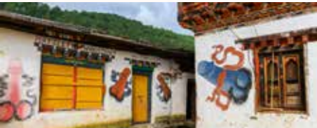
PUNAKHA, Phallus Paintings