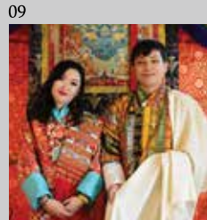
Bhutanese Costume Experience 不丹传统服装