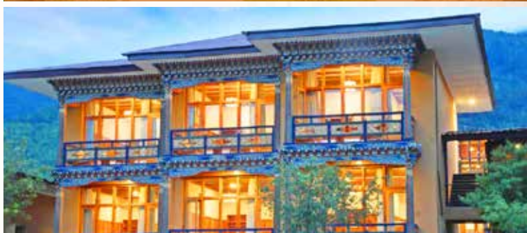
@ Tenzinling Resort, Paro