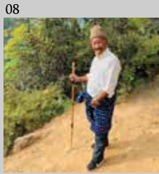
Hiking Stick at Tiger Nest 虎穴寺的登山杖