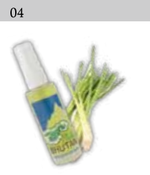
Organic Lemongrass Spray 天然香茅精油