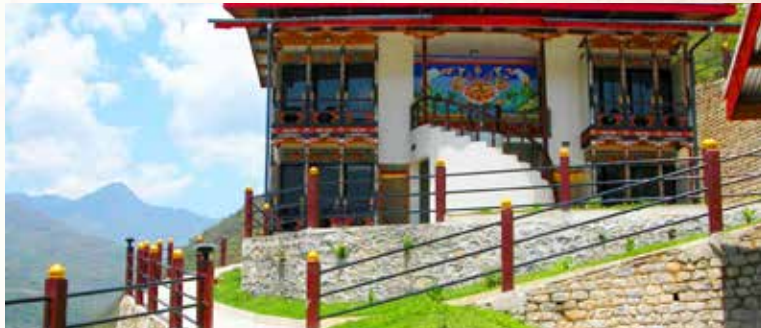
@ Yangkhil Resort