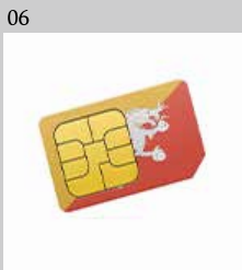
Local Data Sim Card 3GB 3GB网络电话卡