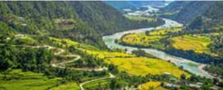
PARO, Paro valley