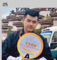
English, Chinese Speaking Guide 中英导游讲解