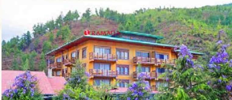
@ Hotel Ramada