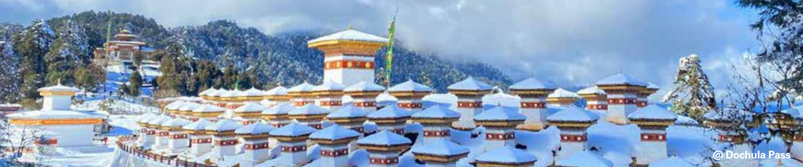
@ Dochula Pass