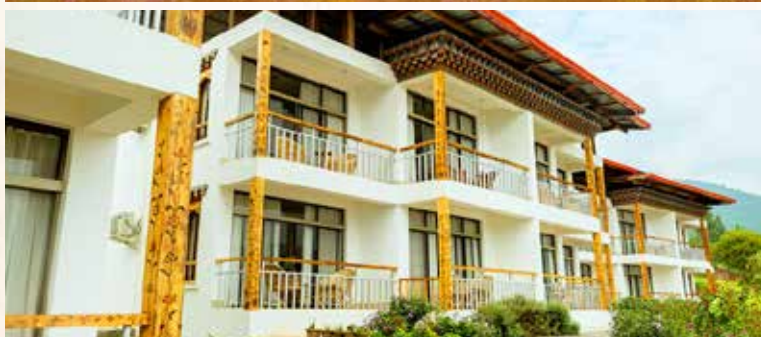
@ Zhingkham Resort